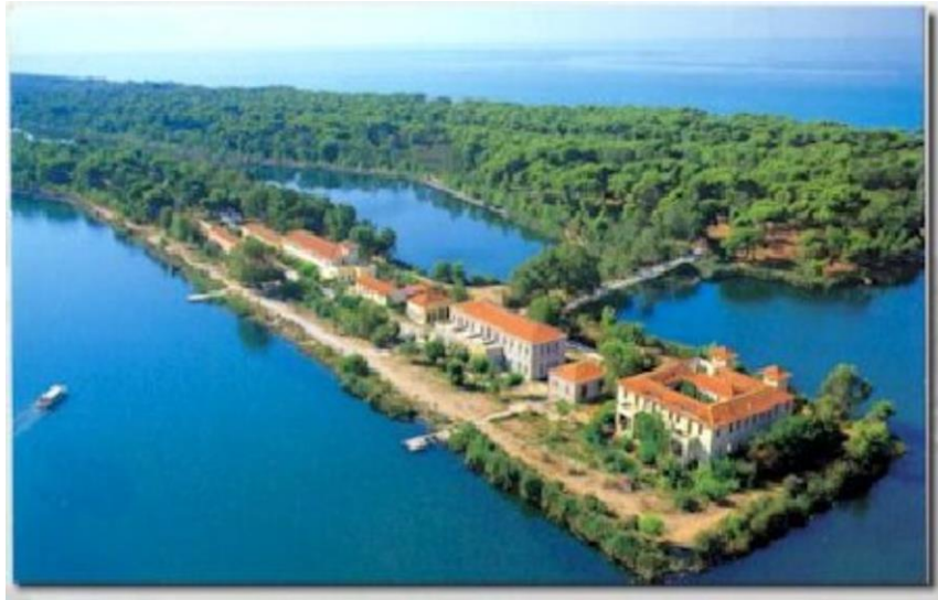
LAKE KAIAFAS, ZACHARO, GR map