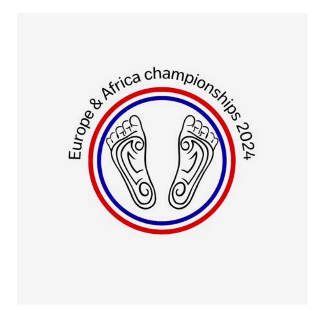
21.-24. August 2024 WSV Maurik – Netherlands