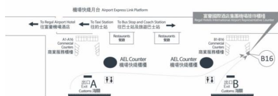
Regal Hotels International Airport Representative Counter Location Map 富豪國際酒店集團機場接待櫃檯位置圖

Kindly contact Regal Hotels International Airport Representatives at "B16" Counter for shuttle bus service. 請到富豪國際酒店集團機場接待櫃檯「B16」與駐機場服務員查詢有關穿梭巴士服務。